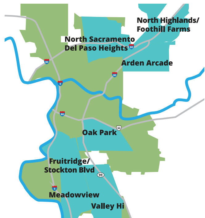
FIGURE 1: MAP OF THE SEVEN NEIGHBORHOODS

In June 2015, the Sacramento County Board of Supervisors voted to approve $1.5 million annually for five years to support operationalization of the strategic plan. This funding commitment has complemented investments by the county's First 5 Sacramento Commission and public health, human services, child welfare, and probation departments. The funding from the Board of Supervisors was structured to focus on engaging community and building and strengthening community infrastructure to quickly mobilize to reduce four specific causes of death. In 2016, the City of Sacramento joined the initiative, committing $750,000 in the first year. Additional funding has been garnered from other sources, including the