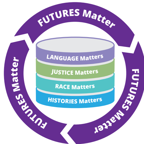
FIGURE 3: MAISHA T. WINN, 2019

As transformative evaluators, we expect our social justice values to influence the process and outcomes of our evaluation work. 13